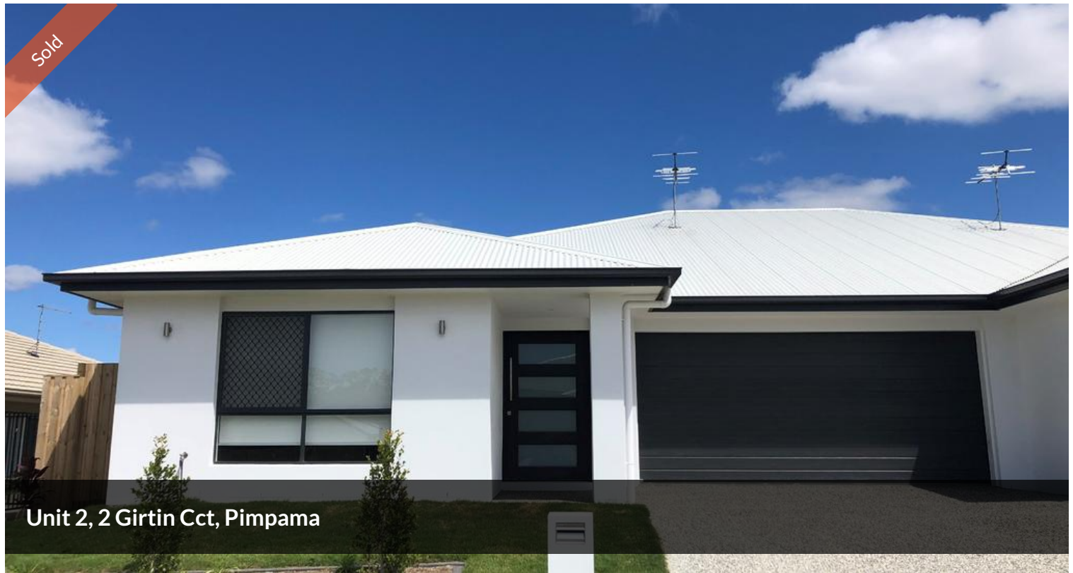
Unit 2, 2 Girtin Cct, Pimpama