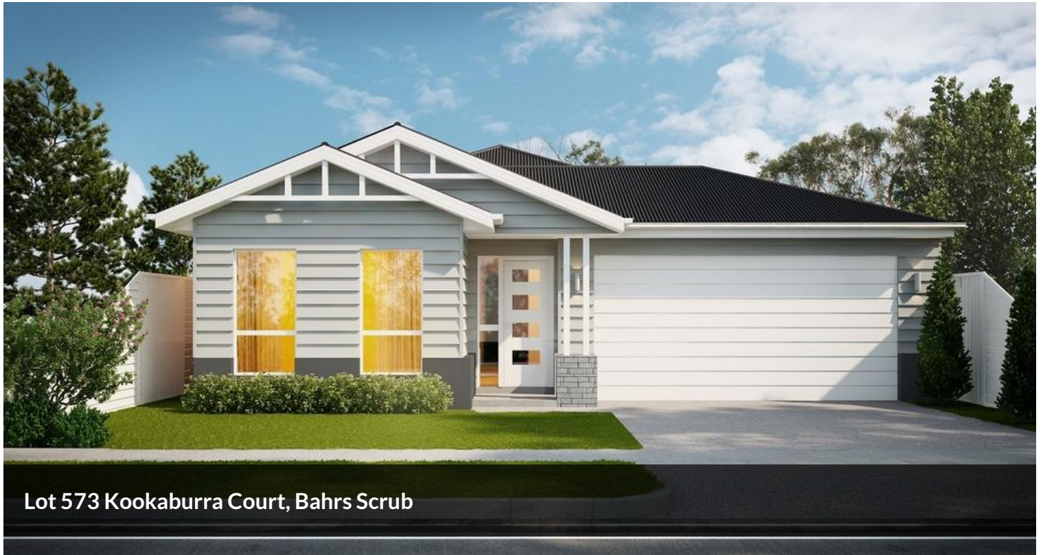
Lot 573 Kookaburra Court, Bahrs Scrub